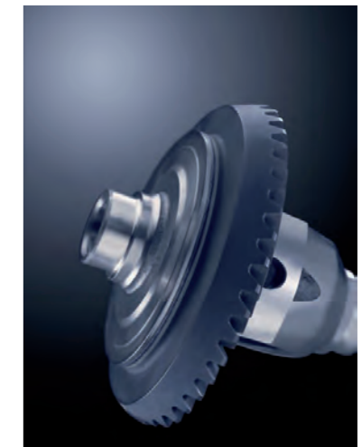
Figure 2: New laser welded design with flat surface.