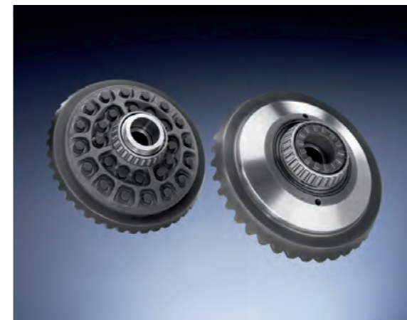
Figure 1: Predecessor design with bolts and screws (left) and new design.

The lower weight, especially of the rotating parts, results in substantial reductions of fuel consumption.